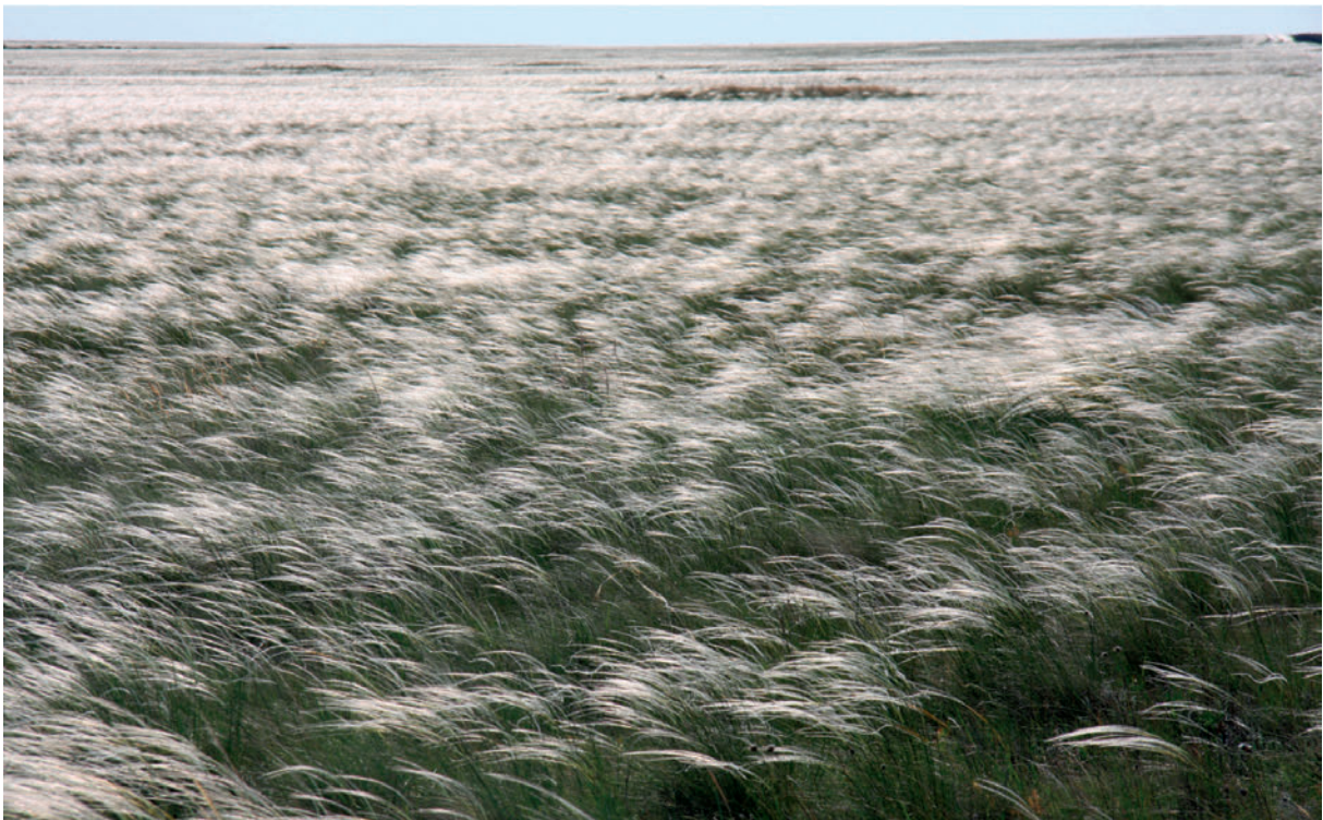
Figure 1: Temperate-dry bunch feather grass steppes (with Stipa lessingiana , Stipa capillata , Festuca valesiaca ) on the dark chestnut carbonate heavy loam soil, Turgai Plateau, Naurzum State Natural Reserve, Kazakhstan.

In total, dry steppes make up 7.1% (192,513.1 km 2 ) of the land area of Kazakhstan. Stipa lessingiana steppes were very common on the plains of the Sub-Ural and the Turgai Plateau. Fescue-feather grass ( Stipa lessingiana – Festuca valesiaca ) steppes with xerophytic forbs ( Galatella tatarica , Pyrethrum achillaeifolium ) on carbonate soils